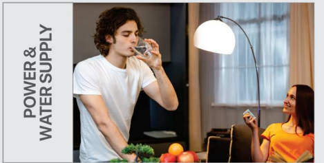
POWER & WATER SUPPLY